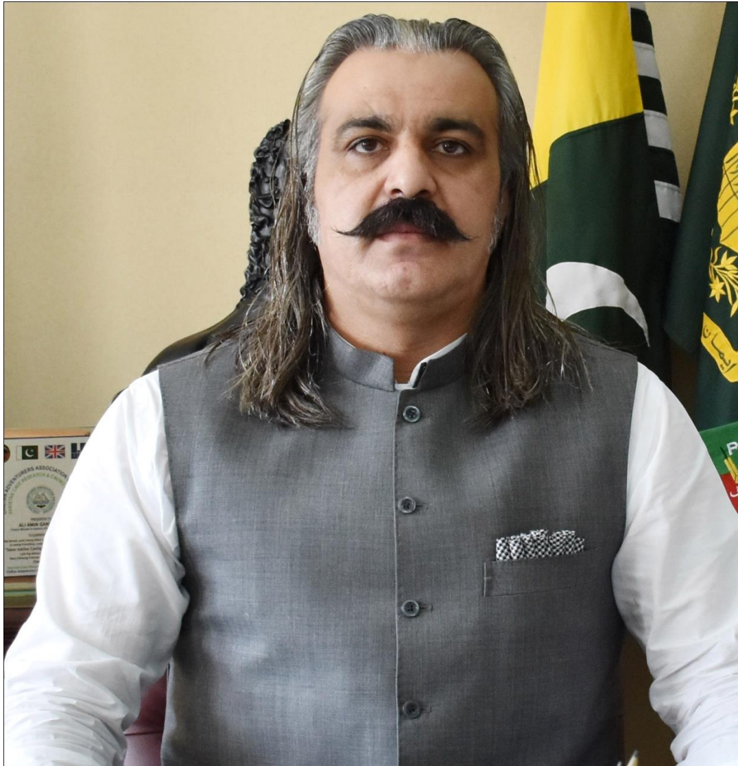
Ali Amin Khan Gandapur Federal Minister for Kashmir Affairs and Gilgit-Baltistan